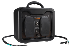
Model 7668-0 UPC: 696471073102

AC Rated Output Running Watts 3000 AC Maximum Output Starting Watts 3500