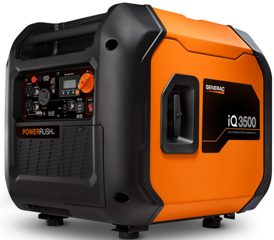
Photograph may not represent actual content.

Model 7723-1 UPC: 696471086355 (50 State) Model 7723-2 UPC: 696471103922 (49 State) Model 7723-3 UPC: 696471103922 (49State/CSA)