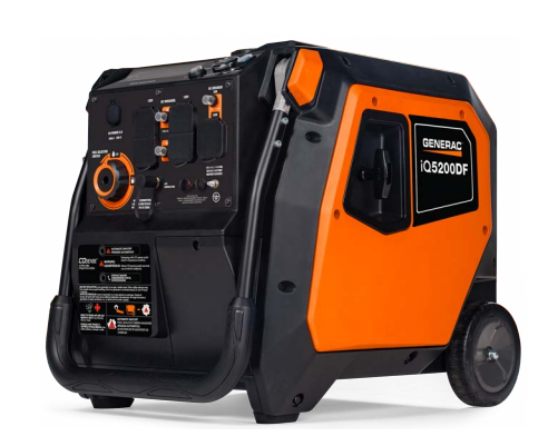
Running Watts / Starting Watts 3900 / 5200 (Gas) 3500 / 4700 (Propane)

Model G0089450 UPC: 696471103786 (49 State) Model G0089470 UPC: 696471104509 (50 State)